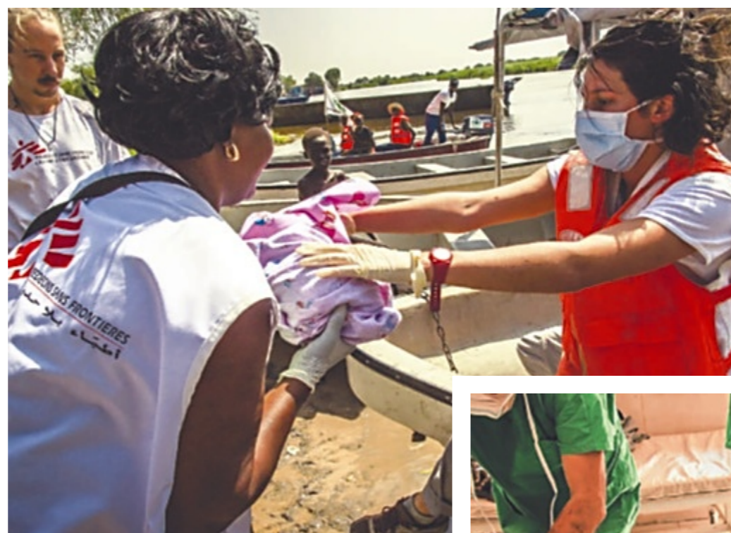
in Old Fangak, South Sudan