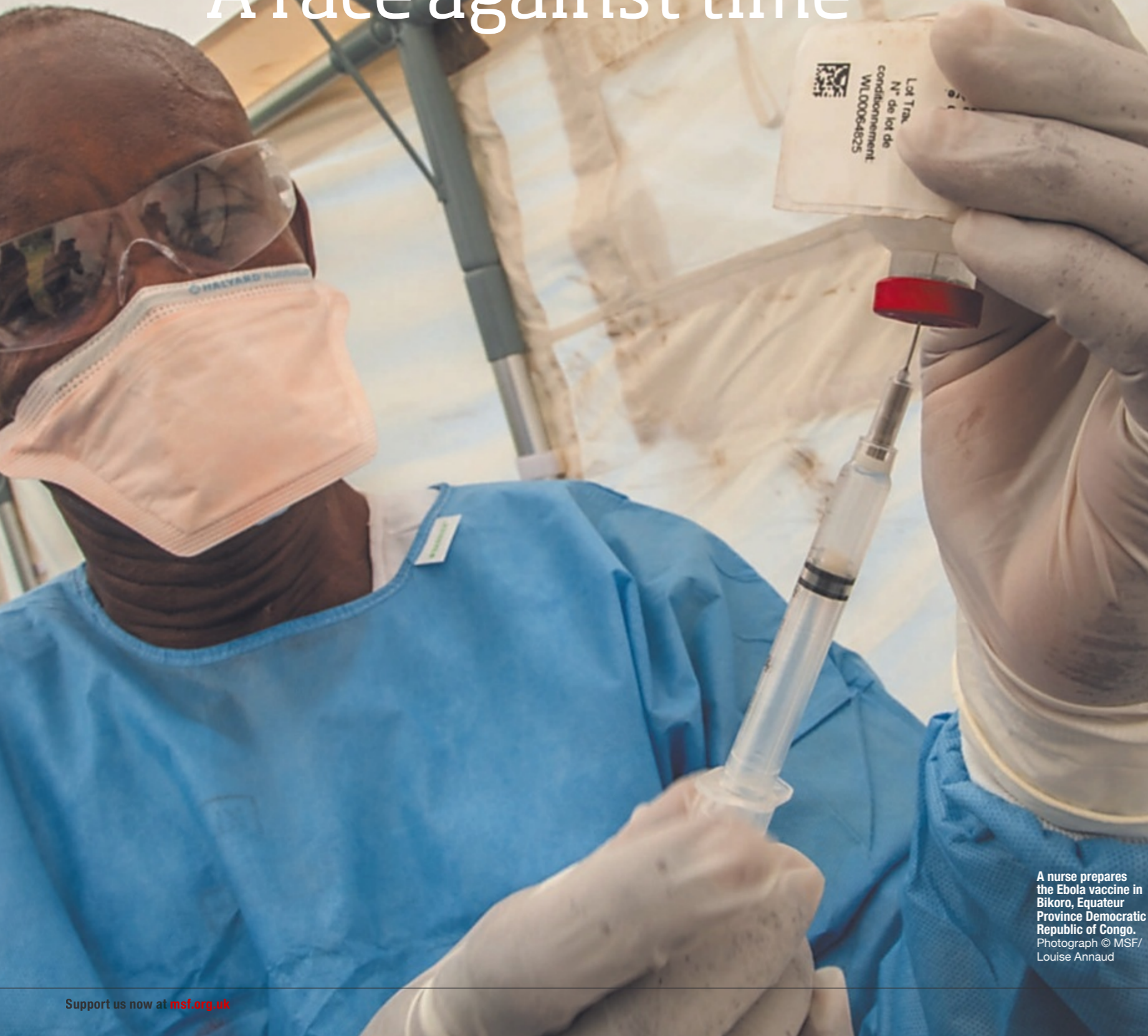
A nurse prepares the Ebola vaccine in Bikoro, Equateur Province Democratic Republic of Congo.