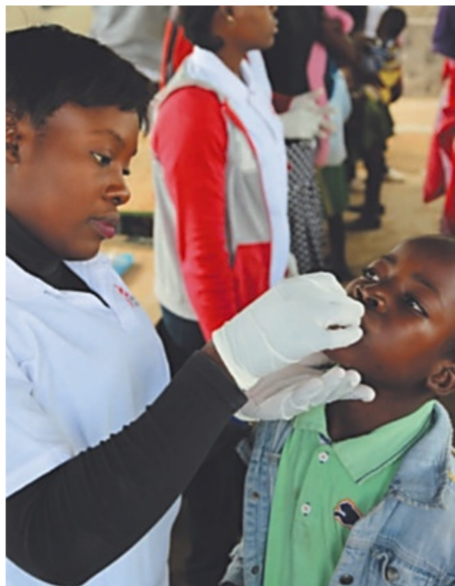
Left: Zambia, April 2016: A child receives a single-dose oral vaccination against cholera during an MSF campaign in Lusaka.

I’ve worked a lot in HIV and TB projects around the world. In many countries these diseases are still emergencies, because people do not always have access to the care they need and patients can also face a lot of stigma from their communities. A lot of people don’t realise that TB is an emergency, because it’s ever-evolving into drug-resistant forms and normal medications don’t work.